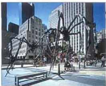
15 Louise Bourgeois (New York City)

Brute Neighbors. About 200 16-inch-long red ants made of cast urethane plastic, copper tubing and glass, on the ceiling and walls of the Hartsfield Atlanta International Airport, a city commission.