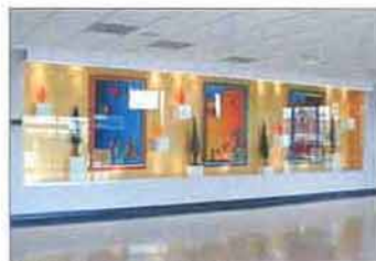
16 Italo Scanga (San Diego)

Epigenisis. A plaza, 50 feet in diameter, using black granite, concrete, a suspended stone, water and plantings, on the campus of the Centers for Disease Control in Chamblee, Ga., commissioned by the U.S. General Services Administration.